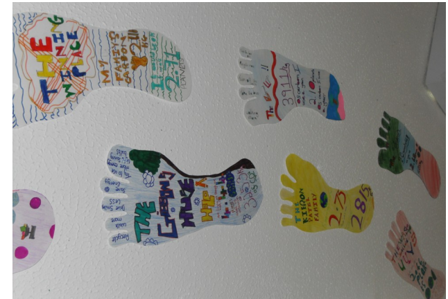
Part of our carbon footprint trail