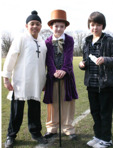
Augustus Gloop, Willy Wonka and George with his marvelous medicine