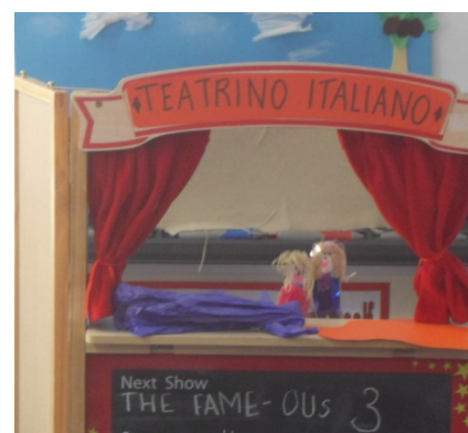
The Fame-ous 3's puppet show